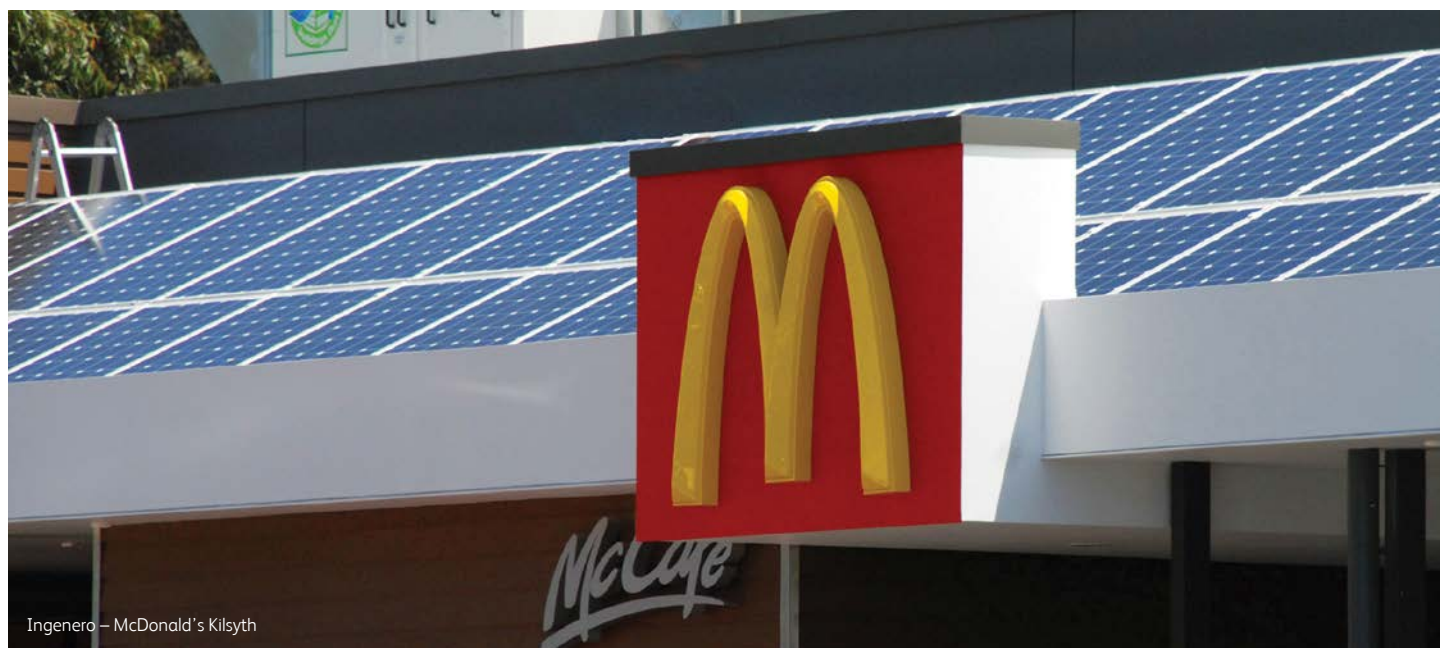
Ingenero – McDonald's Kilsyth

If you are unable to install solar PV panels on your building but wish to source part of your business's electricity from renewable sources, then you should explore GreenPower options greenpower.gov.au