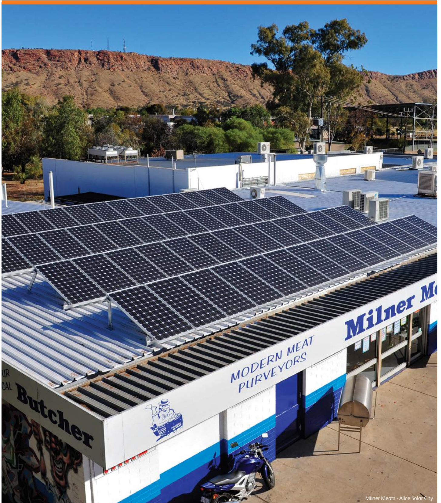
Milner Meats - Alice Solar City